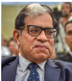
HON'BLE JUSTICE (RETD.) MR. A.K. SIKRI

FORMER JUDGE, HON'BLE SUPREME COURT OF INDIA