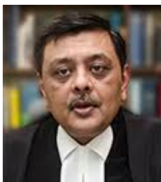
HON'BLE MR. JUSTICE G.S. PATEL HIGH COURT OF BOMBAY