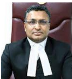
HON'BLE MR. JUSTICE AMIT BANSAL HIGH COURT OF DELHI